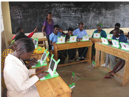
MINEDUC working with teachers at GS Remera in Rulindo (Northern Province)