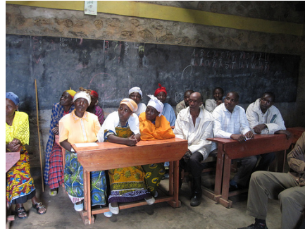
Parents learning about how the XO laptops will be used by their children

In addition to these community sessions, MINEDUC representatives go on radio and TV and write newspaper articles to discuss the project. Social media channels – Facebook, Twitter, a blog, YouTube and Flickr – are also used to discuss new developments and showcase progress. 26